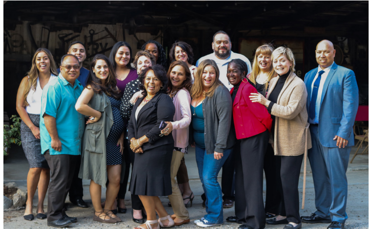
2016 CCPL Group Picture