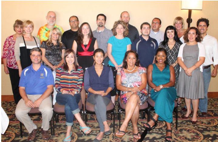
2012 CCPL Group Picture

The Center for Civic Policy & Leadership engages existing and emerging leaders from throughout the Inland Empire Region to support building healthy, safe and peaceful communities. CCPL serves San Bernardino and Riverside Counties and the Eastern San Gabriel Valley region of Southern California (commonly referred to as “the Inland Valleys”). The target population consists of existing and emerging leaders serving our diverse communities of predominantly Latino and African American youth and families. While the project will target 10-20 leaders, the potential impact of policy implementation, compliance, and advocacy has the potential to affect thousands of residents of the Inland Valleys through increased development of critical mass of organizations and individuals aligned and working towards large-scale social change.